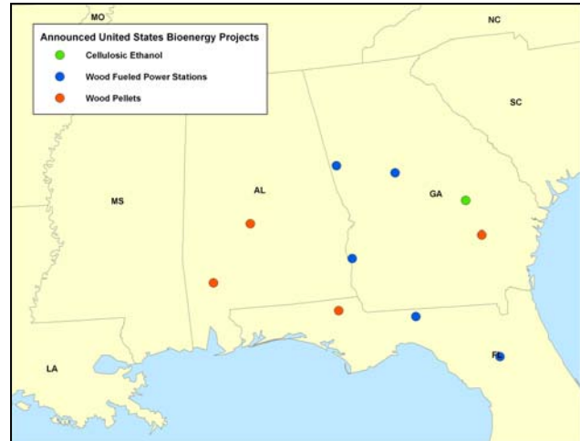
Announced Biomass Projects – Southern Region

This study will provide a comprehensive integrated overview and analysis of the effects the biomass industry's rapidly increasing demand for wood fiber coupled with the relative shortage for residuals will have on wood fiber supply and prices in the years to come.